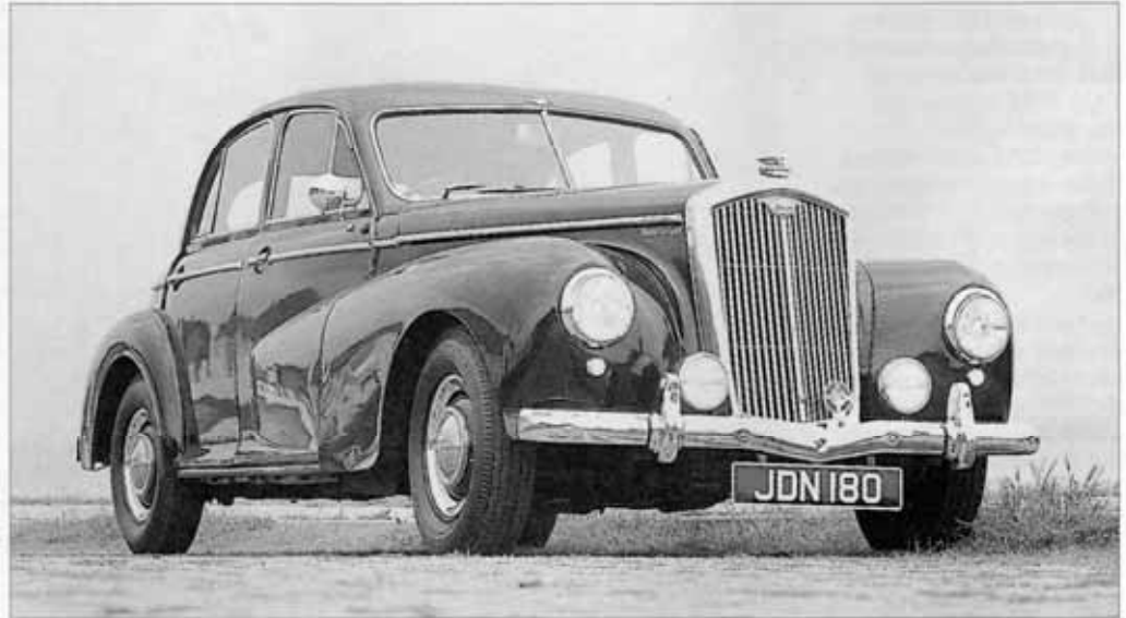
Modern lines of Wolseley 6/80 were first seen in 1948

and it had torsion bar front suspension with leaf springs at the rear. The suspension was revised in October 1950, telescopic shock absorbers replacing the lever arm system used originally.