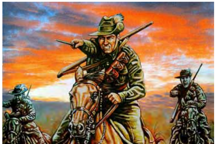
Image: "Charge" Cropped image courtesy of the ANZAC Centenary website and Ian Coate.

http://beersheba100.com.au/history/beersheba.html