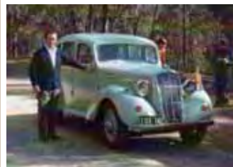
Some celebratory photos from yester year.