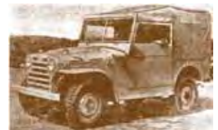
Jeep Fiat Campagnola