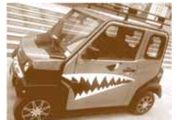
2016 Chinese Electric car