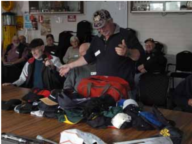
Photos: members puzzled and perhaps reminisced over the assorted "stuff" others brought along for their amusement.