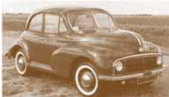
Morris Minor lowlight