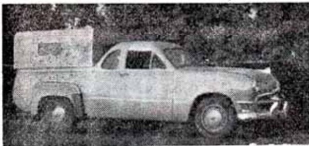
Canopy tops for utilities.

“Hi-Speed” and “Minor” 2-berth caravanettes built to give you happy comfortable holidays and easy towing with any 6 h.p. car or over.