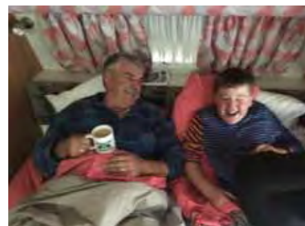
Photo: Sharing special times over our Easter camping/ glamping at Eildon watching Top Gear with our grandson.