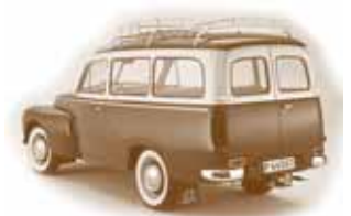
1958 Volvo Duett