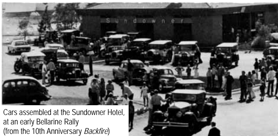
Cars assembled at the Sundowner Hotel, at an early Bellarine Rally (from the 10th Anniversary Backfire )

During the years that the "Bellarine" was held, we had an amazing variety of vehicles from many different clubs besides those of our own members.