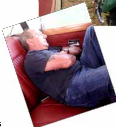
One member even had a snooze with the bagpipes playing.