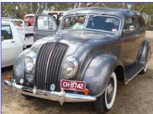
This Fiat camper van and De Soto were among the cars of on display at Natte Yallock.