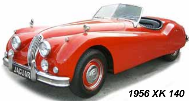
1956 XK 140