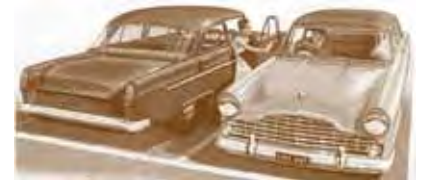
1956 Consul & Zephyr