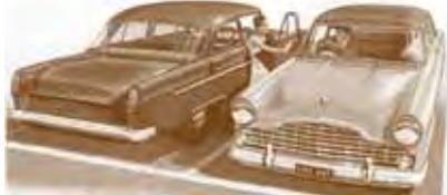
1956 Consul & Zephyr