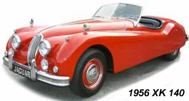
1956 XK 140